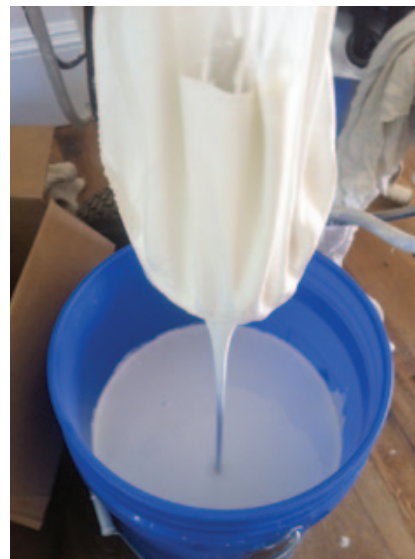
Figure 5. Whether brushing, spraying, or rolling, the author strains all waterbornes — even freshly opened gallons — before using them.