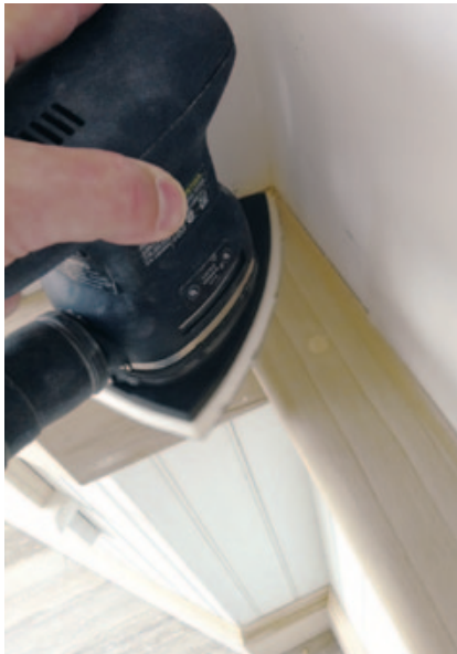
Figure 1. The author sands new trim-work with 120-grit paper before filling holes and priming. Good dust collection streamlines the process.

I like water-based paints because they're healthier for me, my employees, my clients, and the environment. They also have better color retention — they don't fade over time like oils — and they can better handle seasonal wood movement. But we've had to change the way we approach a typical painting job to get the most out of these products, by adopting new techniques and using different brushes, rollers, and spray-