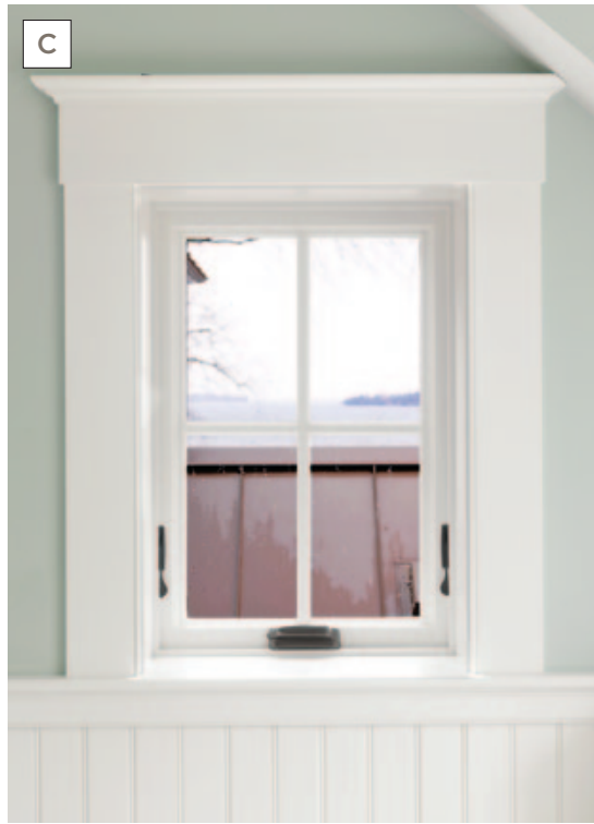
Figure 6. Waterborne trim paints tack up in less than an hour, reducing the risk of dust contamination (A). When properly applied, they produce a smooth cabinet-grade finish with a satin sheen (B, C).

overspray and bounceback. Both our rigs came equipped with high-transfer efficiency HVLP-rated guns, which enhance the performance of these systems (Figure 3, page 52).