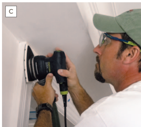
Figure 2. After patching nail holes and dings and sanding again, the author primes the trim (A) with a fast-drying sandable waterborne primer (B). Waterborne primers raise the grain, so once the primer has dried, he sands it with 150- to 180-grit paper to smooth out the surface and prepare it for top-coating (C).