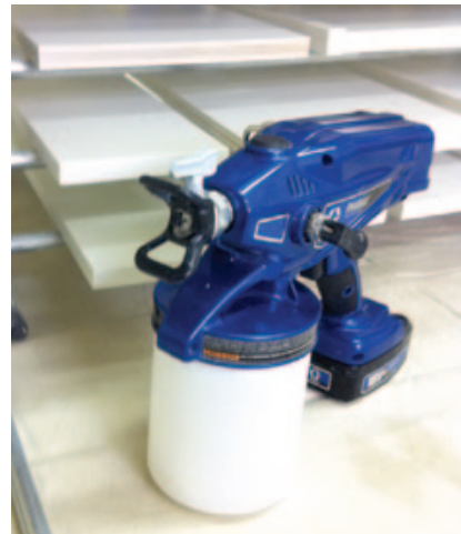
Figure 4. Graco's ProShot 18-volt cordless sprayer works well with waterborne primers and paints and is easy to clean afterward. It holds just a quart, though, so the author reserves it for smaller jobs.

Spraying. High-volume low-pressure (HVLP) rigs are great for oil-based trim finish spraying, but many don't work as well with the heavier viscosity and temperature sensitivity of water-based paints. Instead, we use air-assisted airless sprayers — either our Graco Finish Pro 395 (800/334-6955, graco.com) or our Titan MultiFinish 440 (800/526-5362, titantool.com). These rigs are essentially traditional airless piston pumps except that they're also powered by an air compressor and have a separate air hose that mixes air with the paint where it emerges from the tip. With an air-assisted airless sprayer, the fan of paint hits the surface at significantly lower pressures than with conventional airless sprayers, greatly reducing